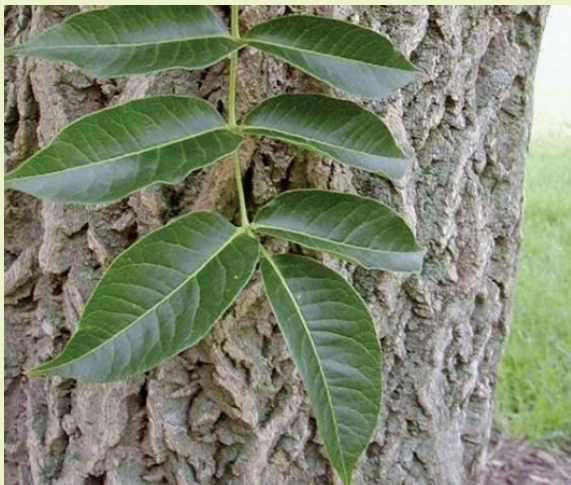
Missouri Botanical Garden