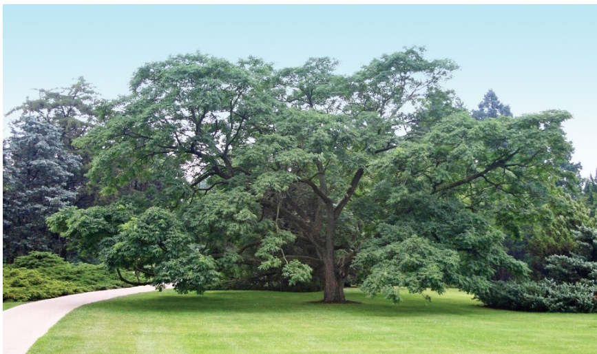
Todd Jacobson, The Morton Arboretum

Public gardens across North America are sharing their horticultural expertise to document cases of plants escaping from cultivation. The goal of this alert is to increase awareness of gardens' observations about Amur corktree's behavior within their properties and to recommend actions to reduce its capacity to spread. For the most current data on this taxon, visit the PGSIP website .